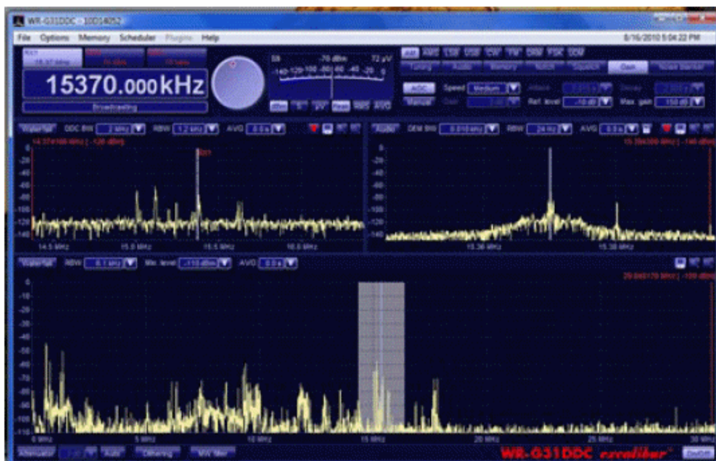
G31DDC screen showing full spectrum display (lower), 2 MHz span DDC display (upper left), and single-signal modulation waveform (upper right)

Dominating the screen are three spectrum displays – dynamic charts of the radio spec-